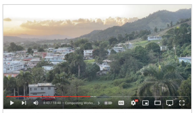
El Yunque National Forest: Environmental Education Case Study

The course participants explored the NAAEE's Community Engagement: Guidelines for Excellence, and discussed how to apply these principles to their own environmental education programs. This course also included lectures, readings, and webinars about community engagement. In addition, participants explored environmental education case studies to become familiar with relevant practices, including a case study that examines educational efforts in Puerto Rico's El Yunque National Forest (available on YouTube).