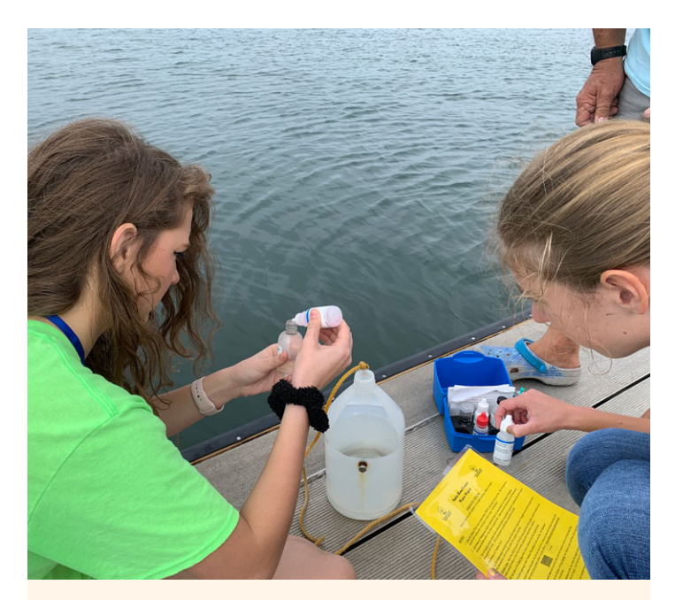
Aquatic Care Team students conduct a dissolved oxygen analysis at the Navarre Beach Boat Ramp, Florida. (Anne Laurenzi)

Educators are continually assessing student learning, either formally through tests and quizzes or informally through on-the-fly judgements about what students are learning. Similarly, evaluators assess project or program effectiveness using a variety of approaches. Evaluating a MWEE can improve its long-term success and inform the design and implementation of future programs and experiences. Evaluation is the systematic collection of information regarding program or project objectives, using a variety of sources and methods, to inform decisions about program or project improvement. In this way, evaluation is both a process and a product for measuring change.