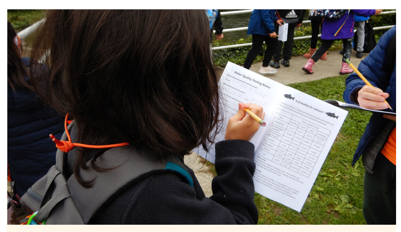
A fourth grader tests Cedar River's water quality in King County, Washington, to determine if it is healthy for salmon and captures notes in a field journal. (Kelly Steffen)

This set of worksheets can be used to plan and implement an Environmental Action Project. There are five total worksheets that cover the following topics: contacts and requests for help, tasks, budget, and maintenance. Use the worksheets that make sense for your students' action project and/or assign different pages to small groups or individuals to complete. These worksheets were adapted from a resource from ShoreRivers in Easton, Maryland.