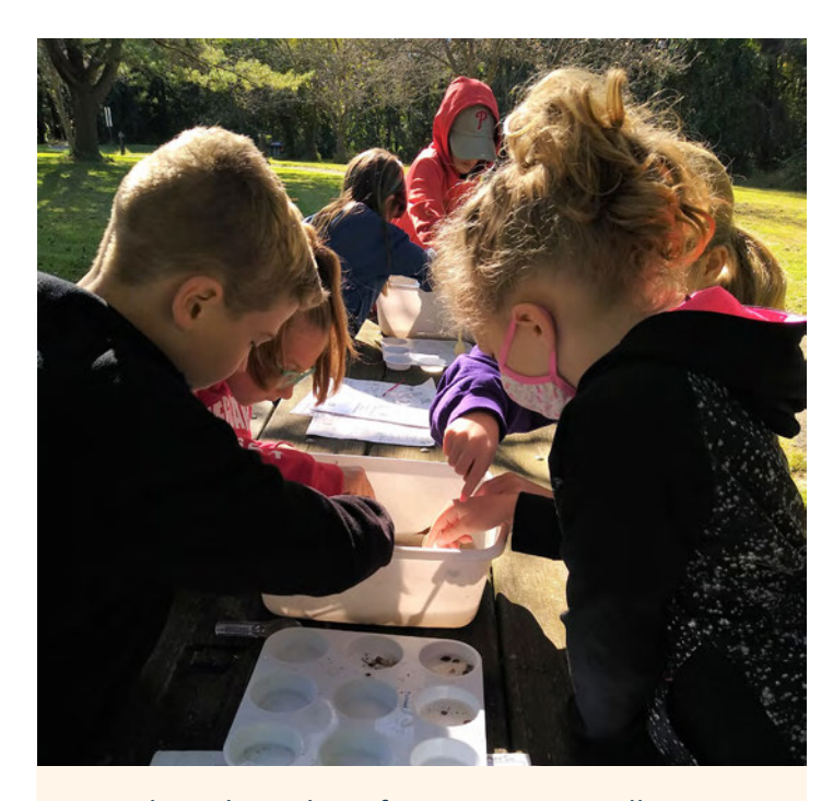
Fourth grade students from Conewago Valley Intermediate School, Pennsylvania, investigate macroinvertebrates to learn about the insect life cycle and adaptations and assess the health of the stream.

administration level. For more information about how to scale up a MWEE from the classroom to a systemic district-level effort, refer to the Sustaining a MWEE section.