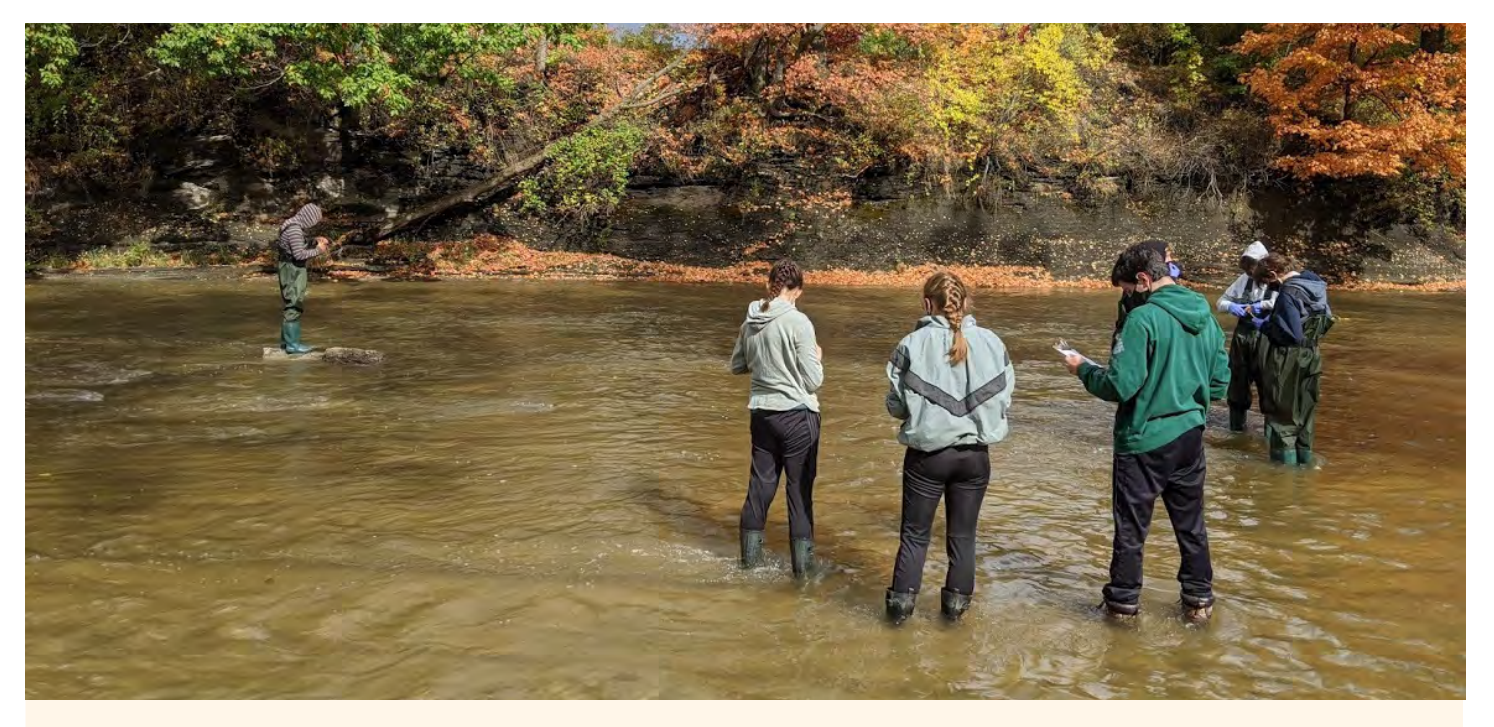
Students from West Seneca Christian School, New York collect water quality data in Buffalo Creek during the annual "Day in the Life of the Niagara River/Lake Erie Watershed" as a part of the Reinstein Woods B-WET project.

The Environmental Literacy Model (ELM) was developed by the Chesapeake Bay Foundation through the Maryland Environmental Literacy Partnership and has been updated in partnership with the Chesapeake Bay Program for use with MWEEs.