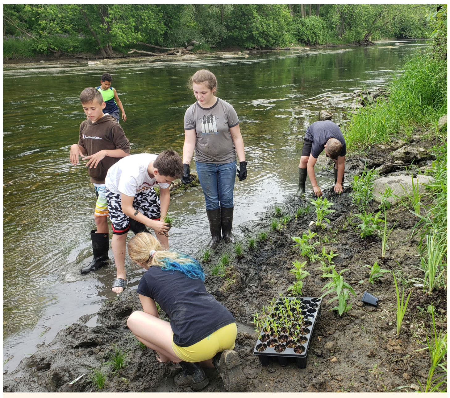
Kuehn-Haven Middle School Flint River GREEN Bridges students plant native riparian plants along the Flint River at Barber Park in Montrose, Michigan.

The most sustainable MWEEs are often embedded in school curriculum and supported with school district resources. Outreach to school board members or central office personnel can help to build the awareness about and support for MWEEs, and partner organizations are often eager to help with this outreach. Many school districts support the installation of schoolyard projects, support system-wide field experiences for students, or otherwise provide ongoing, reliable funding for components of the MWEE. And if a school happens to be planning construction, teachers can sometimes work with facilities staff to incorporate green elements, including outdoor classrooms and other schoolyard projects that can be used by students for authentic research (e.g., a stormwater retention pond can be a great wildlife habitat if planned appropriately).