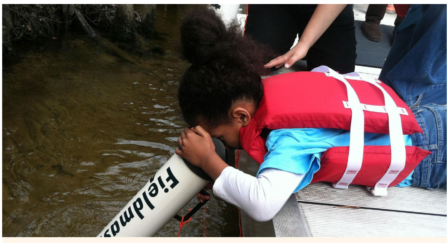
Elementary students make underwater observations to learn about their watershed at the Science and Discovery Center of Northwest Florida.

The Issue Investigation ELM component provides the opportunities for students to construct knowledge and understanding through multiple investigations or lessons around a life-relevant issue. Some of these investigations should take place outdoors, while others may take place in the classroom. By working together throughout the investigation to construct, communicate, and refine explanations about the driving question, the Issue Investigation component of the ELM demonstrates how students engage in the Issue Definition, Outdoor Field Experiences, and Synthesis and Conclusions essential elements of a MWEE. Issue Investigation may include supporting questions developed by the teacher that cover required curriculum content and lessons; however, be sure to leave space for questions and investigations developed or co-developed by your students. Use this student-directed space to plan out how you will guide students through each step of Issue Investigation. After completing the MWEE, you can fill in what your students worked on.