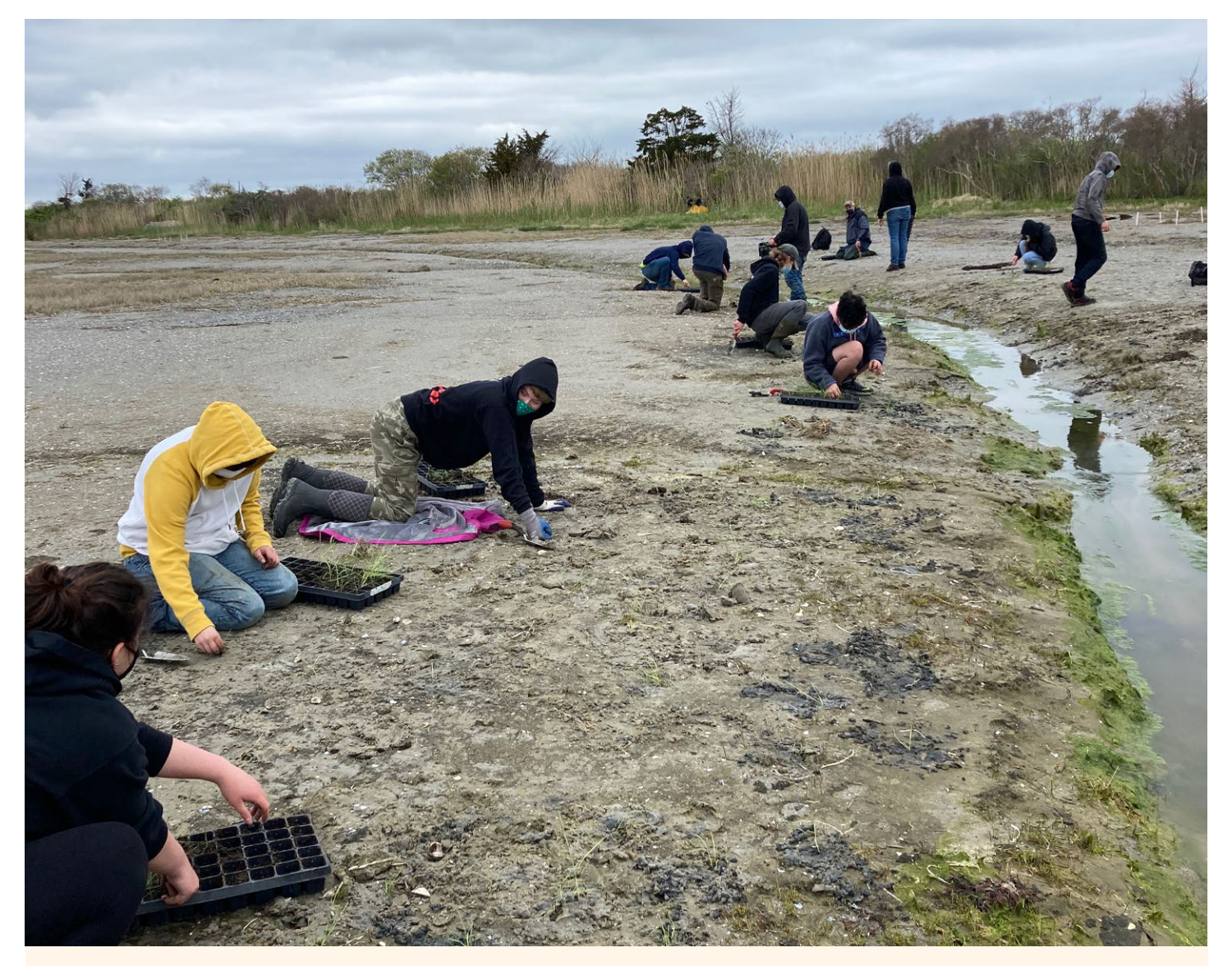
Chariho Regional High School students plant seedlings to protect Quonochontaug Pond Marsh in Charlestown, Rhode Island from sea-level rise.

The Audit Tool can also be used as a reflection tool both during and after implementation. When used in this way, educators can identify where the implemented MWEE could be improved for next time, and determine the strengths of the MWEE. Evaluators might even use the Audit Tool as a starting place for designing outcome measures across several MWEE designs or many implementations of the same design. In this way, you can be sure you are creating objectives and outcome measures that align with the MWEE framework. The MWEE Audit Tool references several helpful tools and worksheets that are available in the MWEE Guide and Student Worksheets Toolbox.