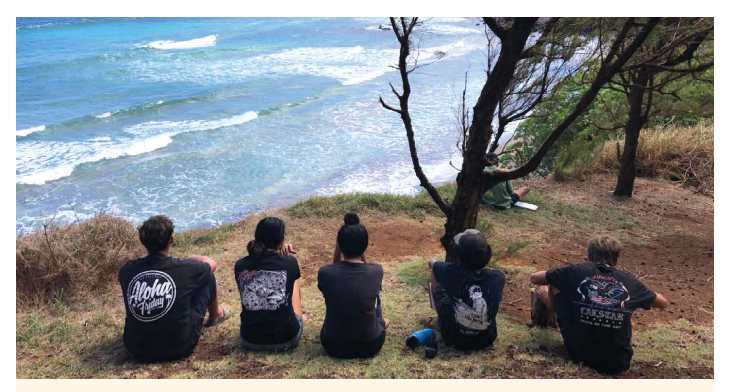
Hana High School students from the Learning Endeavors' Champions of Coastal Resilience program observe the coastal area of Kōkī Beach on Maui as they conduct their ecological study. ( Brianna Craig )

To explore the driving and supporting questions, students gather information by making observations, finding and reading credible sources, talking to experts, and carrying out field investigations. Students also consider environmental policies and community practices and reflect on personal, stakeholder, and societal values and perspectives to develop a comprehensive picture of the root causes of the environmental issue.