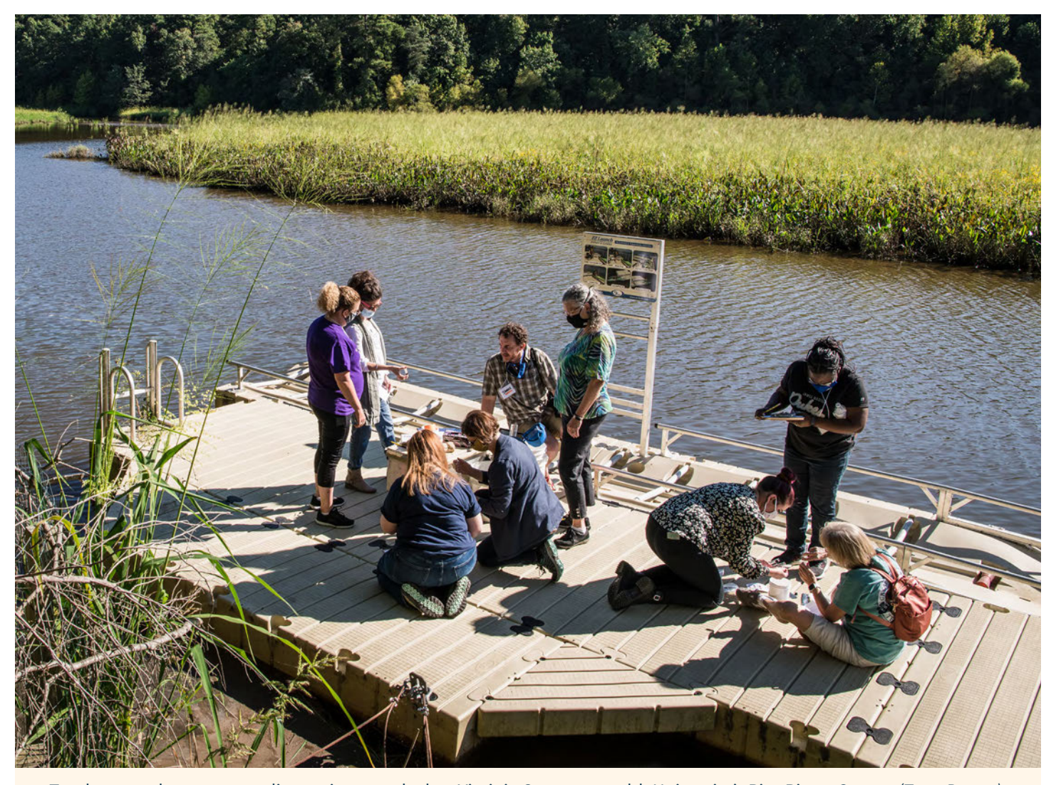
Teachers conduct water quality testing on a dock at Virginia Commonwealth University's Rice Rivers Center.

noaa.gov/office-education/bwet/resources/mwee-guide