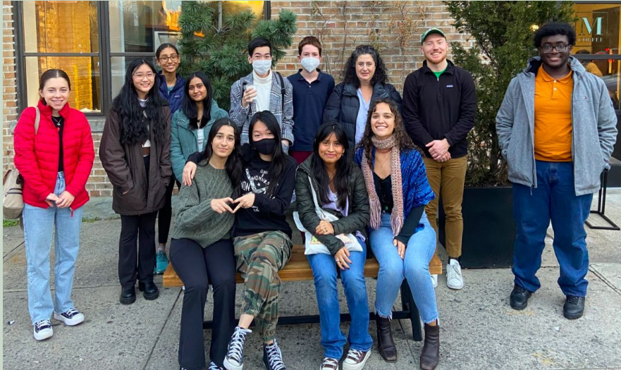
10 of our Youth Steering Committee Members from all 5 boroughs of NYC, 2022